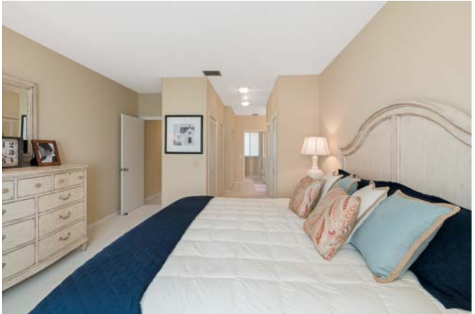
Master Bedroom Suite