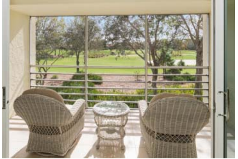
Living Room - to Screened Porch & Dining Room