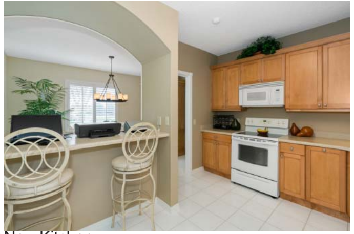
Spectacular New Kitchen