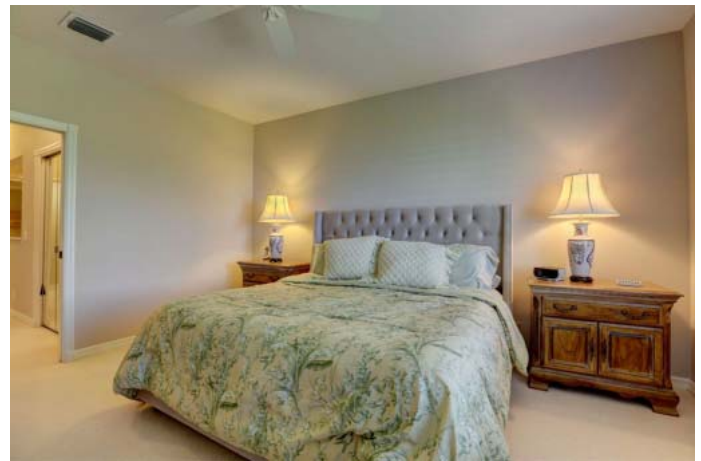
Master Bedroom Suite With Wide St. Lucie River View