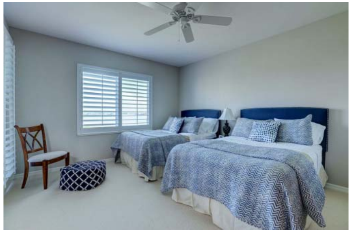
2nd & 3rd Bedrooms w/Shared Bath