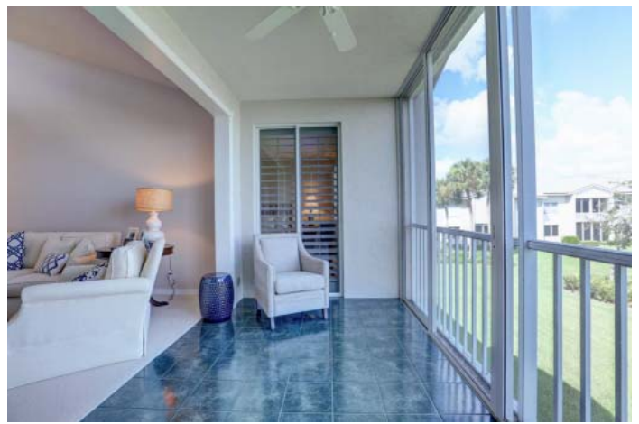
Florida Room & Preserve & St. Lucie River Views