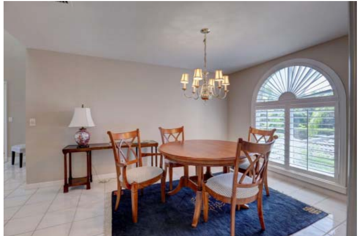
Living Room - Dining Room - With Wide St. Lucie River View